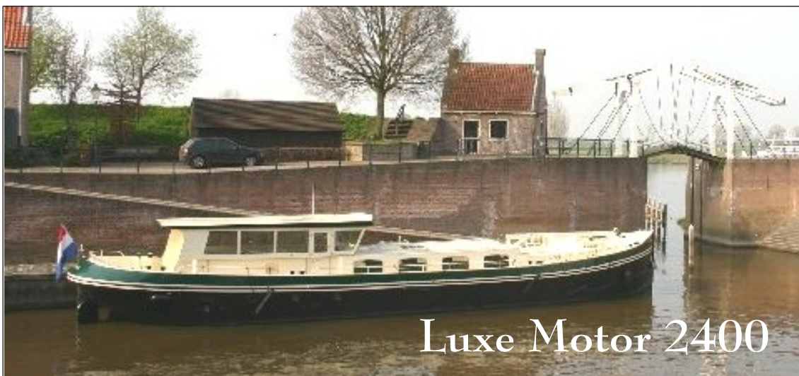
Luxe Motor 2400